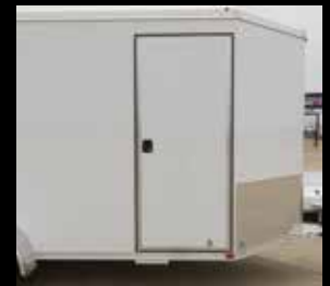
32" Side Door