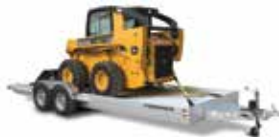
Model 3110 Open car hauler versatile for also hauling ATVs and skid loaders