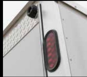
LED Exterior Lights