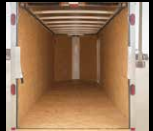
Featherlite Advantage Wall Lining