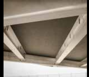
Aluminum Frame, Rails & Side Sheets