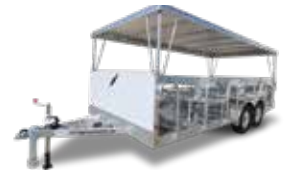
Model 3115 Passenger tram with benches

For more information on the Featherlite Full Line of Trailers, visit www.fthr.com