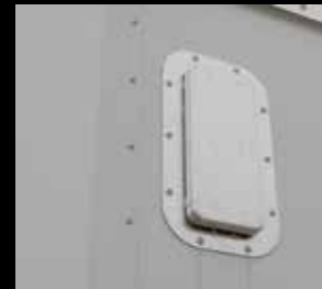
Streetside Air Vent