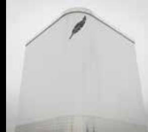
Aerodynamic Nose & Gravel Guard