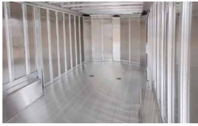
All aluminum construction

If you can imagine it, chances are we can build it for you. Our goal is to provide