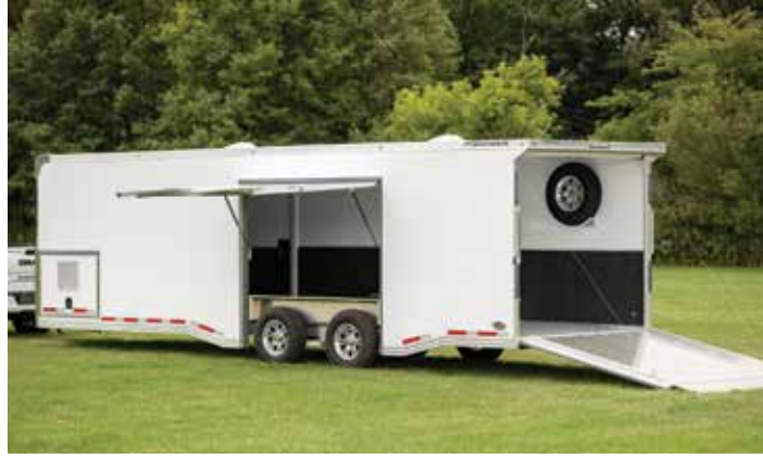
Premium escape door on 4410