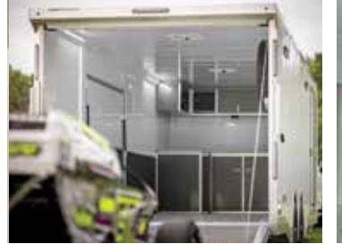
Wide array of cabinet options