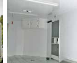
White lined & insulated interior

Note: All dimensions are approximate. Some trailers may be shown with options.